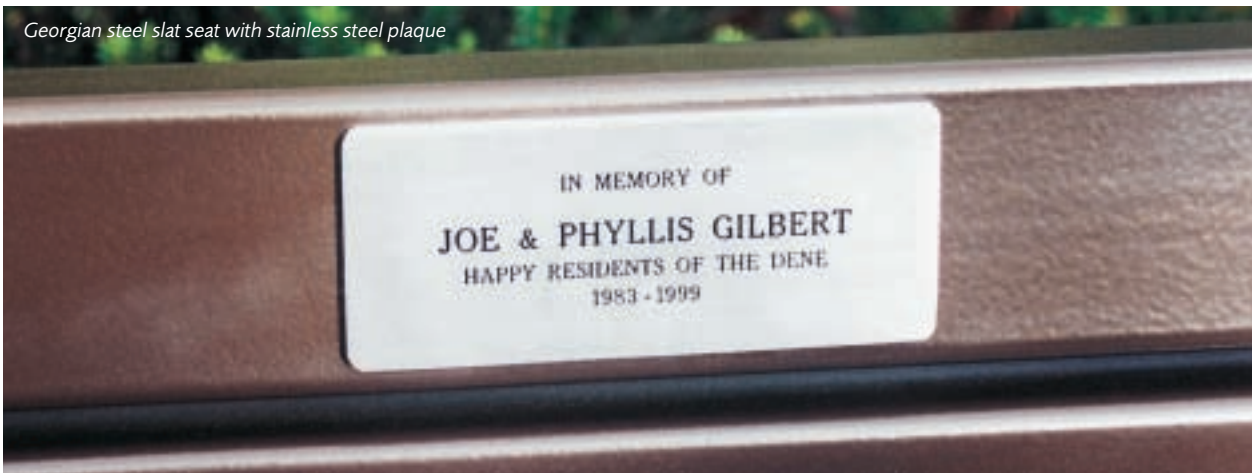
Georgian steel slat seat with stainless steel plaque