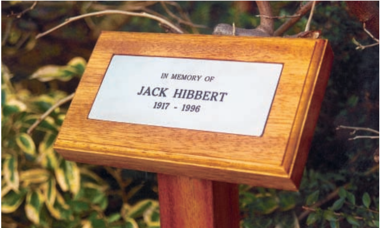
Commemorative Tree Post in iroko with stainless steel flush fitting plaque

Trees are an effective alternative to seats in commemorating people or events, and our tree posts are designed to be placed in front of a tree, and to take our standard size 63 x 152mm plaques, in either flush fitting or surface mounted form. These posts are substantial, and have a decorative relief around the edge.