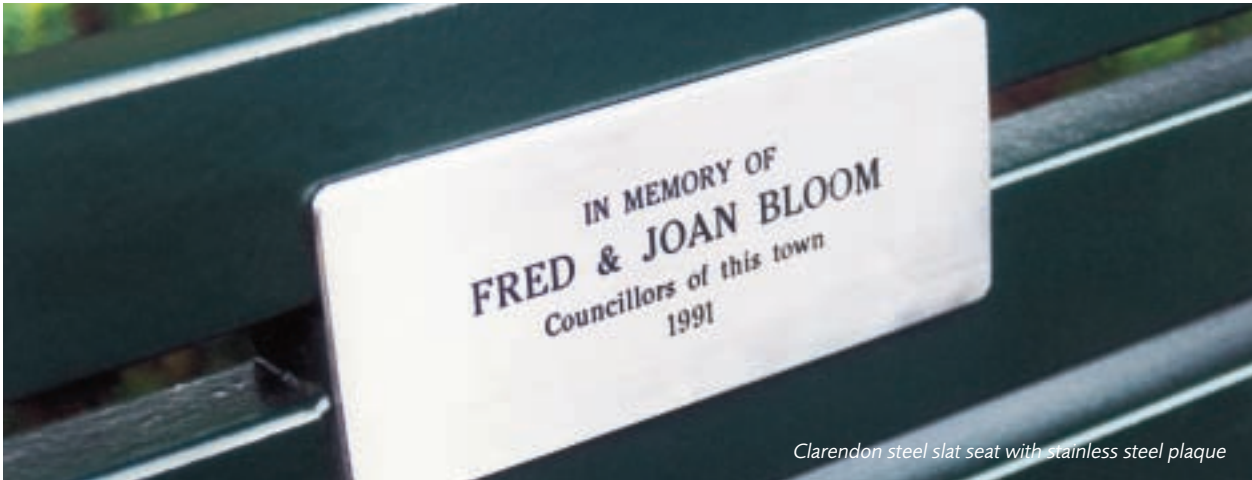
Clarendon steel slat seat with stainless steel plaque