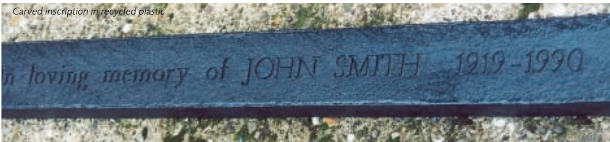
Carved inscription in recycled plastic